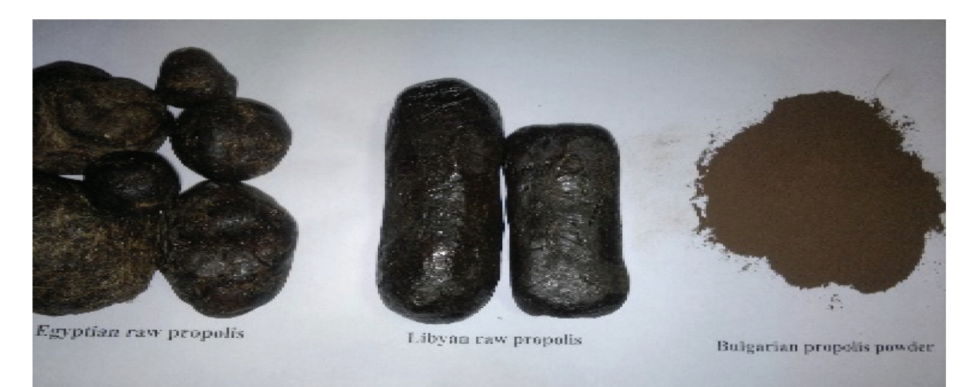
Figure 1. Propolis (Egyptian, Libyan, and Bulgarian).

(BioTek, Bedfordshire, UK) were used for cell-based cytotoxicity assay.