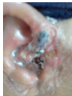
Figure 4. Right ear, Basal Cell Carcinoma (BCC) seen in the skin of ear and adjacent areas, sloughing of cancer cells seen after Bee Venom subcutaneous injection.