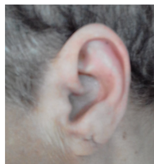
Figure 2. normal left ear

The stages of treatment: The signs of relief were after first injection, as the irritations and annoyance inside the ear shows instant relief and completely disappeared after only one week of bee venom therapy. The affected skin which was showing thickening and color changes become gradually smaller in size, with disappearance of the malignant growths picture from the affected area. Pus and exudates were accumulated after application of the topical ointment inside the ear, which removed and cleaned before each injection. The ear returned to normal status with comments of patient that she is hearing normally from the affected ear, feel signs of relief and health. These effects were seen after 10 days only from first bee venom application. The tumor area became smaller and smaller with color changes disappeared gradually (Figures 2-8).