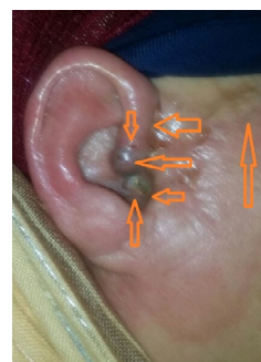
Figure 3. Right ear, Basal Cell Carcinoma (BCC) seen in the skin of ear and adjacent areas, slight edema seen after Bee Venom subcutaneous injection.