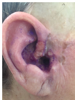
Figure 6. Right ear, Basal Cell Carcinoma (BCC) seen in the skin of ear and adjacent areas, removal of cancer cells after Bee Venom subcutaneous injection.