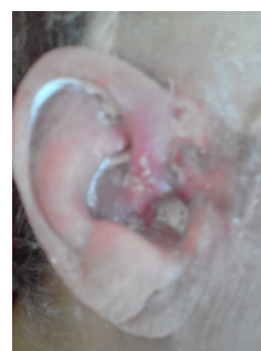
Figure 5. Right ear, Basal Cell Carcinoma (BCC) seen in the skin of ear and adjacent areas, removal of cancer cells after Bee Venom subcutaneous injection.